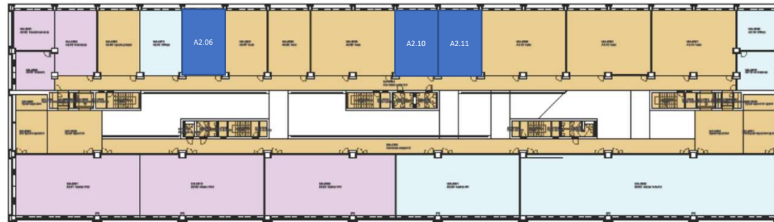
SUPSI_0011 Campus Mendrisio / 02 Secondo piano